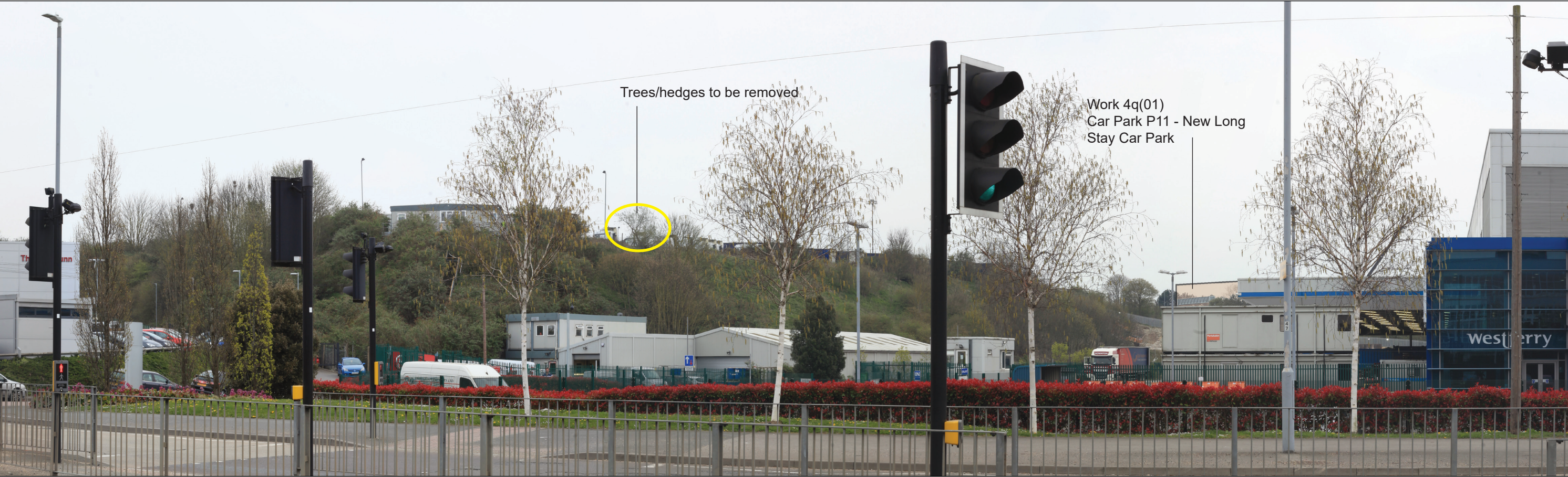
Block Form of Max. Parameters (Viewing Distance 300mm)