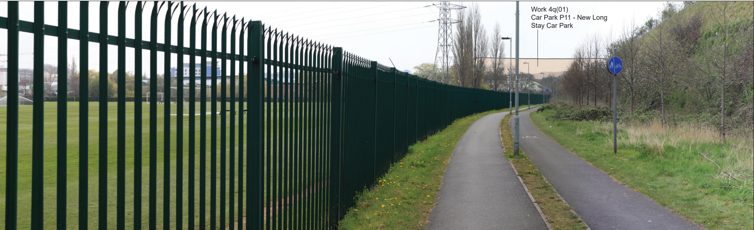
Block Form of Max. Parameters (Viewing Distance 300mm)