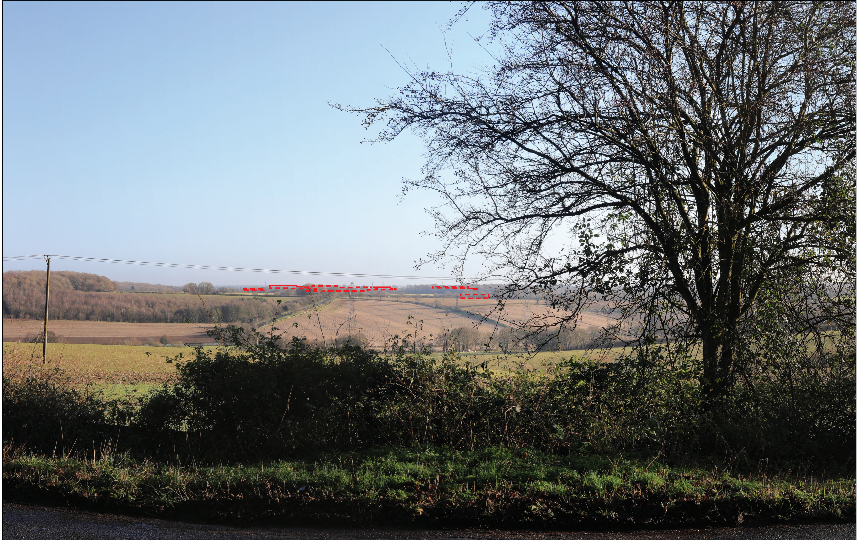
Wireline of Max. Parameters (Viewing Distance 500mm)

Accurate Visual Representation based on winter viewpoint photography. Refer to Appendix 14.6 of this ES [TR020001/APP/5.02] for corresponding viewpoint information.